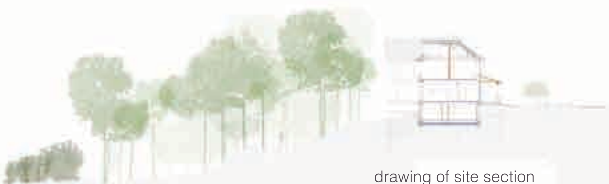
drawing of site section