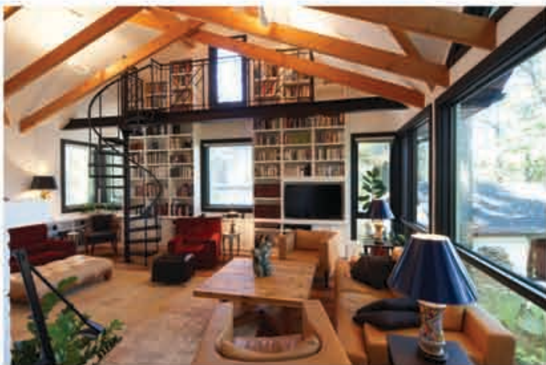
living room - catwalk

The side extension, a former porch, was re-built and had the underside of its wood frame gable roof exposed to make a double-height living room. The double-height space was used to stack books with a new catwalk level and spiral stair.