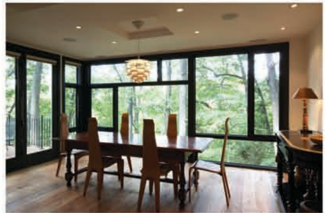
framed views of the ravine from the dining room